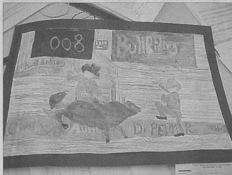
Garwood Elementary Best of Show- Jose Gonzales.